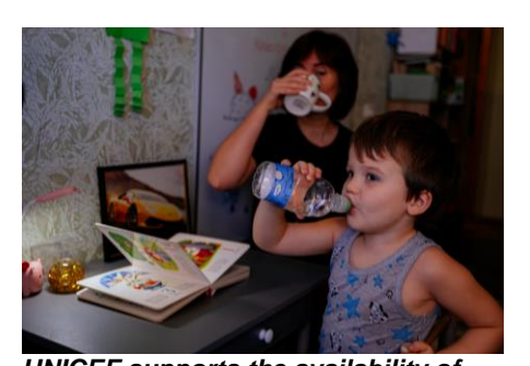
UNICEF supports the availability of water in Kharkiv City

Water, Sanitation and Hygiene: So far, in 2024, UNICEF has ensured continuous access to safe water and sanitation services for 691,496 people. This has been achieved through repairs and rehabilitation of WASH facilities and networks and the supply of water treatment chemicals and equipment to water utilities. As part of life-saving WASH response, WASH supplies have reached 1,139,796 people in need.