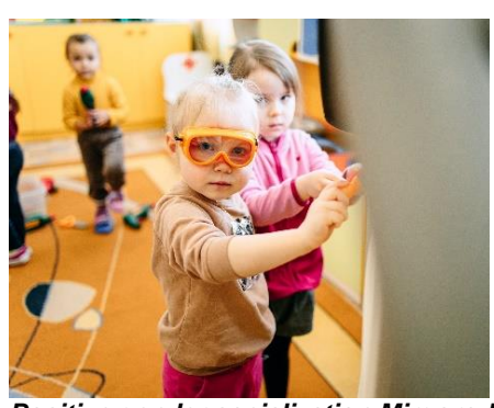
Positive gender socialization Mirgorod Gymnasium No. 2

In partnership with <u>Girls</u> and the <u>Gender Culture Centre</u>, UNICEF strengthened the gender competencies of 1,330 individuals (95 per cent women<sup>6</sup>) in February. Their knowledge on gender-transformative parenting increased by 16 per cent on average (from 54 per cent to 70 per cent) in pre- and post-tests. To further support these efforts, handbooks on gender competencies for health workers, teachers, youth workers, social workers and psychologists were produced and distributed, as were handbooks on gender-transformative parenting and socialization for frontline workers, parents/caregivers and children. The OKY mobile app on menstrual hygiene and health, gender stereotypes and gender-based violence (GBV) was launched, supported by a social media campaign and 11,000 stickers and flyers distributed in schools, public toilets and youth centres. The application has reached 21,500 girls aged 9 to 16 as well as parents and caregivers.