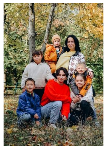
Olga and her biological and adopted children

UNICEF supported the Office of the Ombudsman and the National Social Services to monitor the living conditions of 205 children in institutions (80 girls, 121 children with disabilities) and 50 other children (12 girls, 30 with disabilities), including 23 who returned from host countries. Child protection concerns were identified and officially recorded by the Ombudsman's Office and addressed by relevant child protection bodies at central and local level.